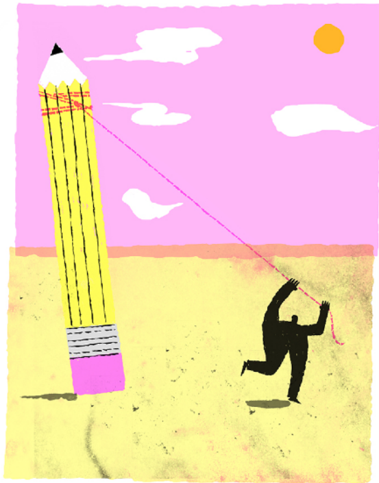
Illustration by Conor Nolan