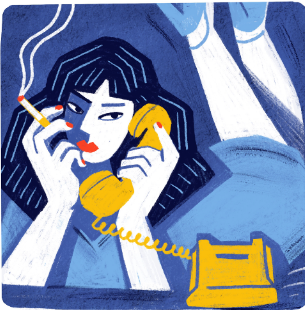
Illustration by Claire Prouvost