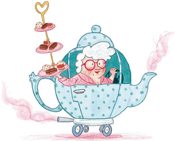
Illustration by Sheena Dempsey