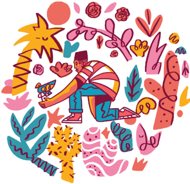
Illustration by Ashwin Chacko